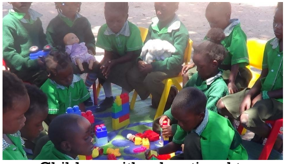
Children with educational toys

In their formative years children establish the cognitive, emotional and social foundations upon which they build their future. Colouring pictures, crafting and reading might seem to be pleasant pastimes to adults but are actual fact extremely important to a child's development. Yet in Africa too many children are deprived of this opportunity to develop these skills in childhood because their parents cannot afford their school fees.